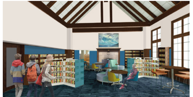
Middle School Room

A new space with the privacy, safety and comfort teens need to feel relaxed and welcome at the Library, whether they are studying for a test, hanging out with friends, or relaxing with a good book.