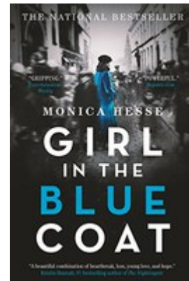
Girl in the Blue Coat by Monica Hesse