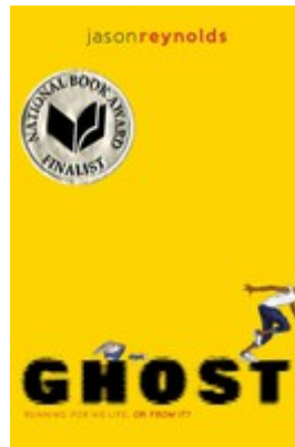
Ghost by Jason Reynolds