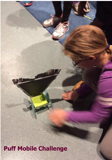
Puff Mobile Challenge