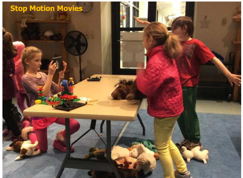
Stop Motion Movies