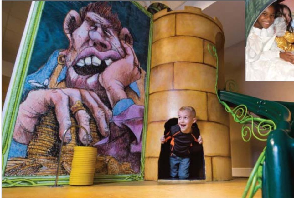
A boy crawls out of a cubby hole in the ogre's castle in the Jack and the Beanstalk section of the Once Upon a Time exhibit. Kids can climb up a beanstalk to slide down into the castle (on right) and count the ogre's gold coins (on left).

If you know someone who wants to work toward their high school diploma, the library can provide them with a laptop and mobile wi-fi hotspot for extended checkout so they can study. These new kits work in conjunction with the MOlearns.com program from the MO Department of Elementary and Secondary Education. Visit rhcl.org/high-school for more information.