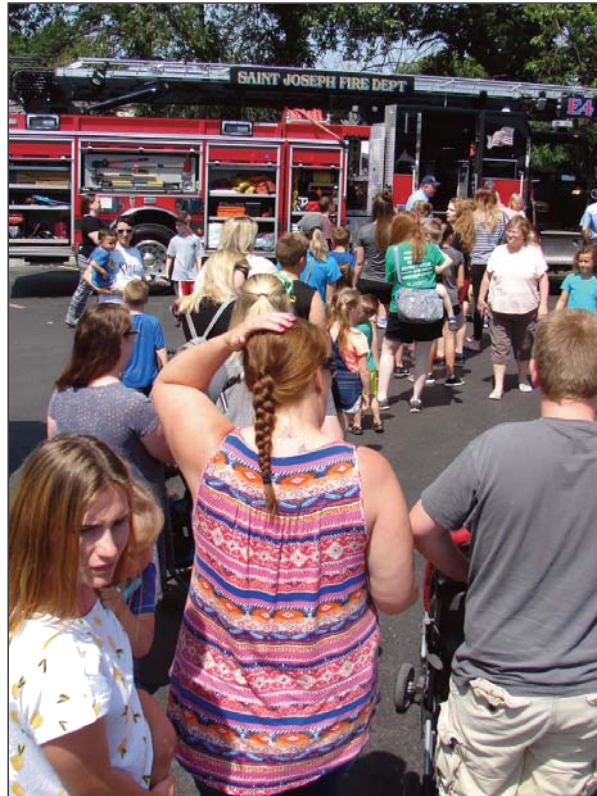
The fire truck is always a popular attraction with kids and families at Touch-a-Truck.

And then there's Touch-a-Truck, back for a third year and quickly becoming a Summer Reading Program tradition. This year, the popular festival of emergency vehicles, work trucks and other industrial rides will be on two days: