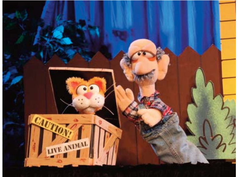
When a cat won't leave him alone, Mr. Johnson tries everything to rid himself of the cat, including sending her into space in the Mesner Puppet Theater's show that will come to the library on July 15.

"I always touch on the importance of playing with kids and especially while reading to foster that love and enjoyment of books," she said. "My mantra is the more interactive you can