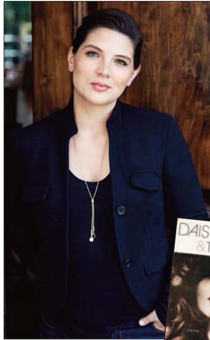
Author Taylor Jenkins Reid

I was completely invested in the characters, especially the strong female ones. Telling the story from the perspectives of the band members, managers and producers – who provide different versions of the same story – gives