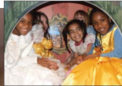
In the Cinderella exhibit, children can dress up like princesses and watch scenery pass by and hear the sound of horse hooves as they ride to the ball in a carriage.