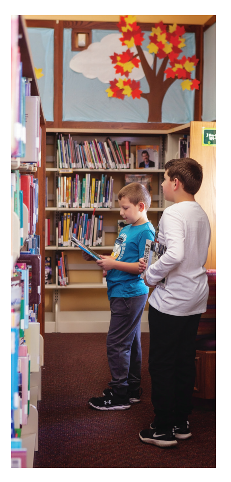
Reed Memorial Library Foundation P.O. Box 788 Ravenna, Ohio 44266