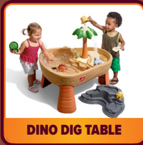
DINO DIG TABLE

Complete logs for JUNE AND JULY and submit them by AUGUST 31 to be entered into the grand prize drawing!