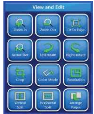
Image Enhancement Patented Technology

The ScanEZ station applies patented image science to enhance photos, documents, newspaper articles, digital photographs and more. 1-click technology improves your images, restoring and reviving your memories and history.