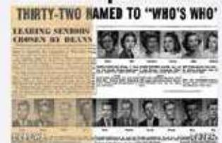
Newspapers & Documents