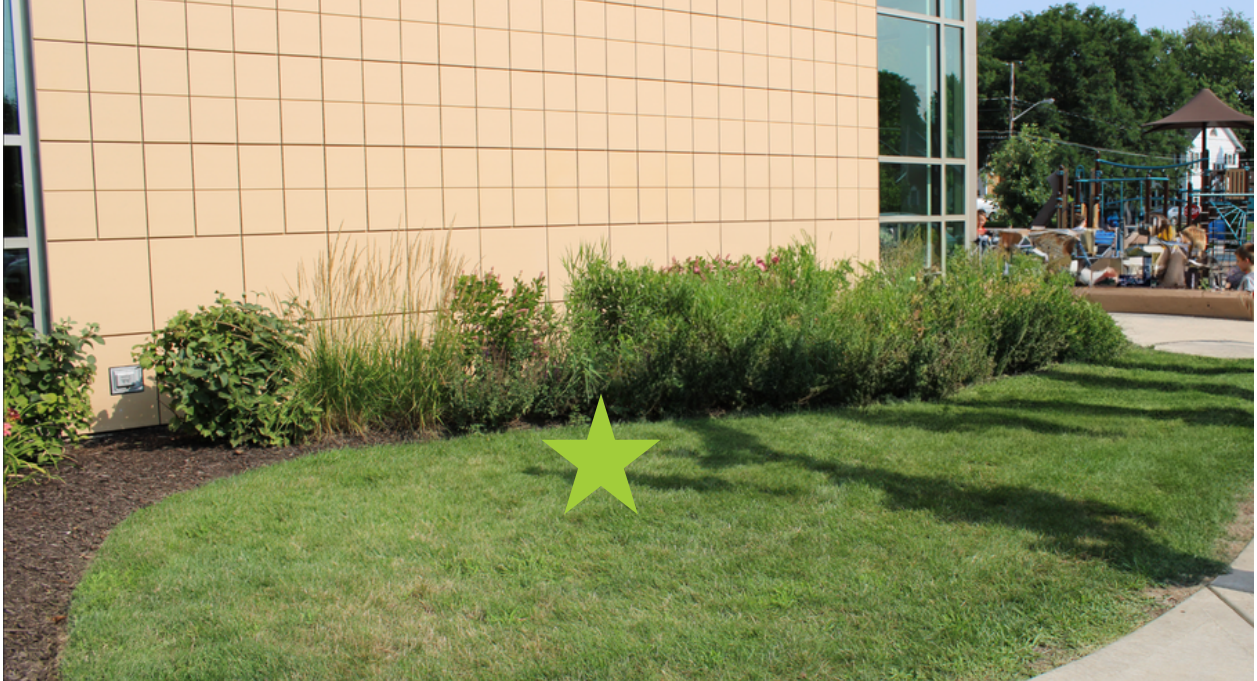
Sculpture site with view to Library Park and playground.