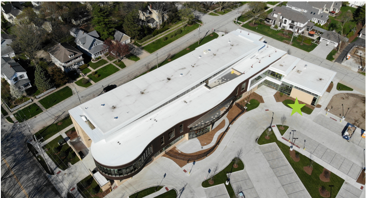
Aerial view of library campus.