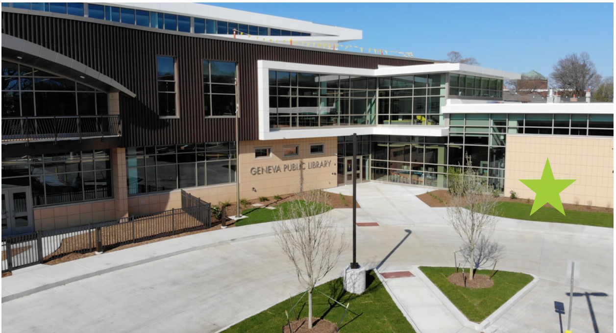
South entrance to the building. Sculpture site indicated by the star.