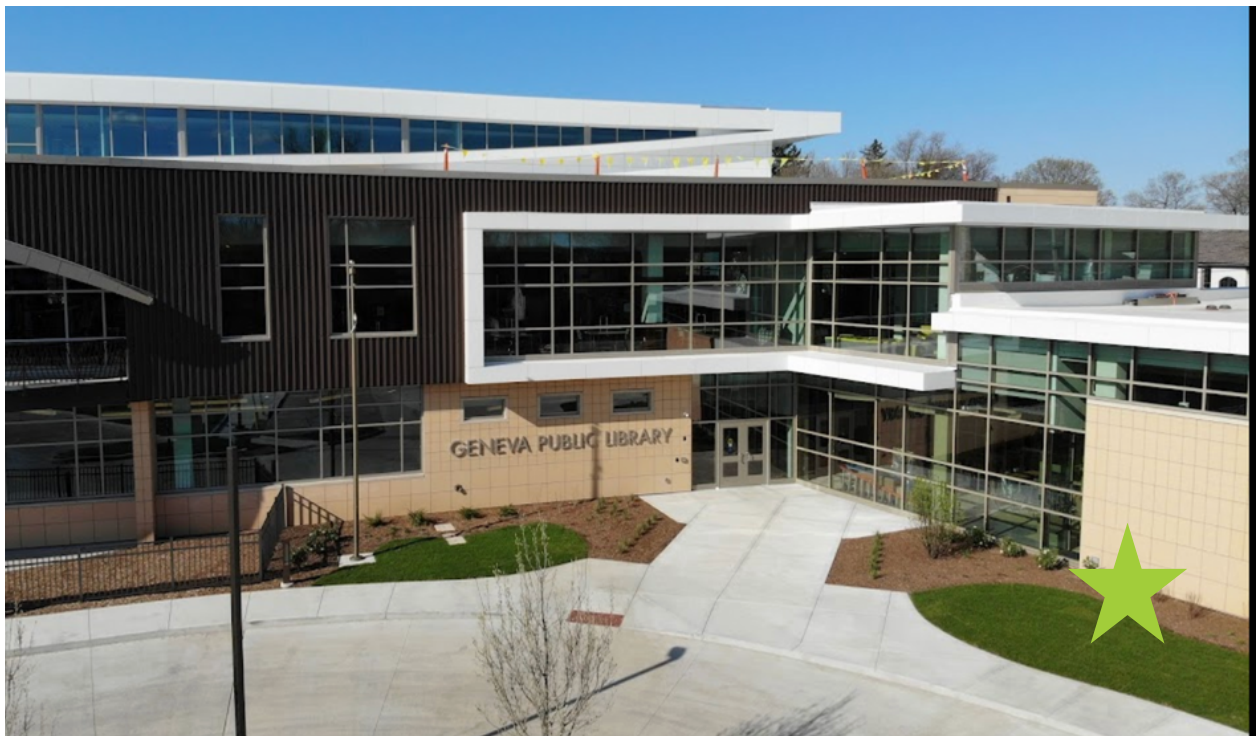
Aerial view of south entrance to the building. Sculpture site indicated by the star.

The sculpture will be installed near the primary entrance to the building. It will be seen and enjoyed from a variety of vantage points, primarily by visitors entering the library from the parking lot. Lighting for the sculpture is already in place and the sculpture will be placed in front of a large expanse of wall, so artists may consider the interplay of light and shadow when the sculpture is viewed at night. Other utilities could be made available at the location of the sculpture if desired by the artist and incorporated into the total project budget.