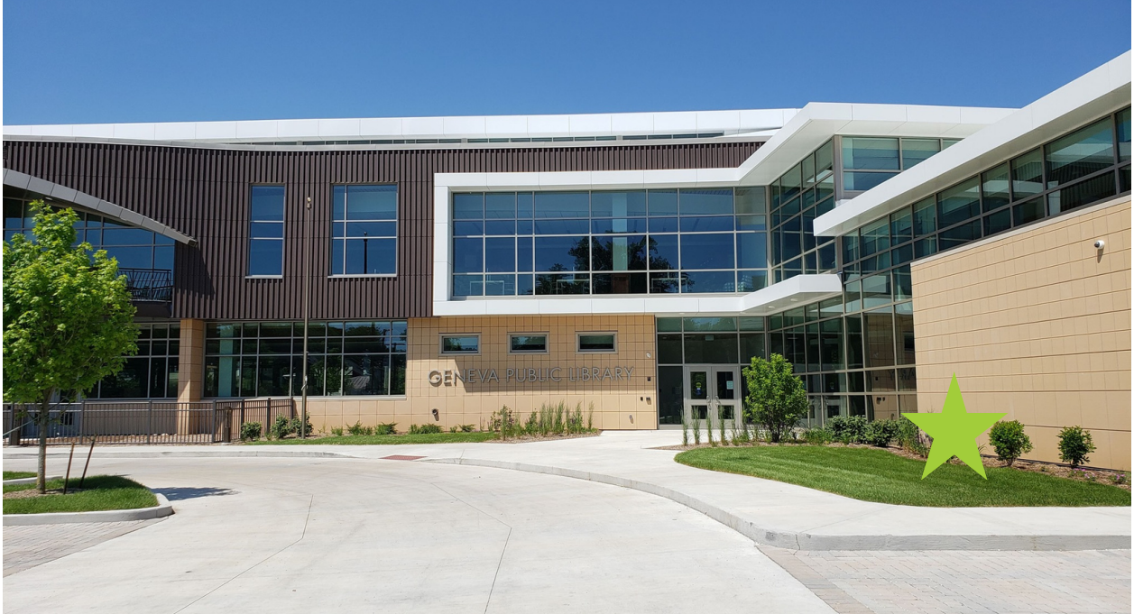
South entrance to the building. Sculpture site indicated by the star.