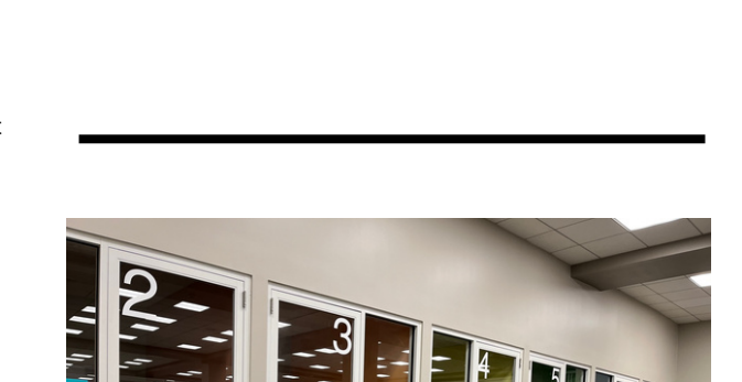
Study Rooms #2-7 (1st Floor)