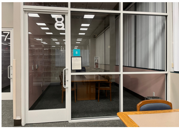
Conference Room #8 (1st Floor)

Study rooms 2-7 are <u>NOT</u> reservable and are available on a first come, first served basis. Please check with a staff member for availability.