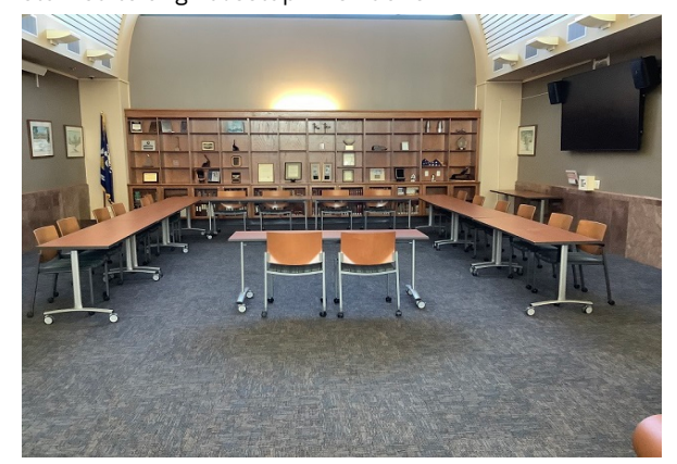
Thielen Community Room (2nd Floor)

Kitchen area available with coffee pots, refrigerator, ice maker, and microwave (Kitchen shared with Thielen Room). Equipment available upon request. Furniture can be moved, but must be returned to original setup when done.