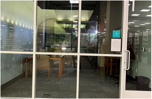
Study Room #1 (1st Floor)

Kitchen area available with coffee pots, refrigerator, ice maker, and microwave. (Kitchen shared with DeBakey Room) Equipment available upon request. Furniture can be moved, but must be returned to original setup when done.