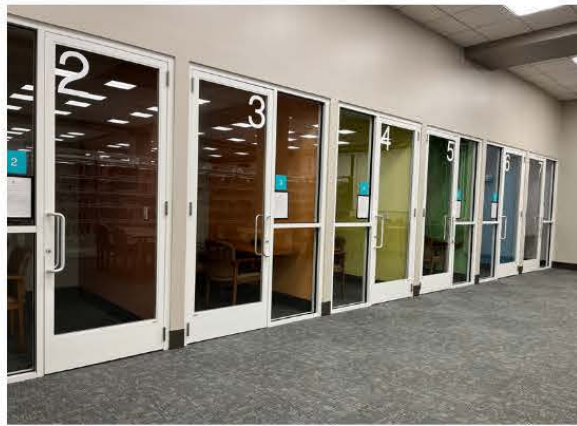
Study Rooms #2-7 (1st Floor )

Kitchen area available with coffee pots, refrigerator, ice maker, and microwave. ( Kitchen shared with DeBakey Room ) Equipment available upon request. Furniture can be moved, but must be returned to original setup when done.