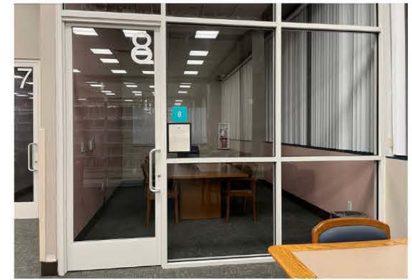
Conference Room #8 (1st Floor)

Study rooms 2-7 are NOT reservable and are available on a first come, first served basis. Please check with a staff member for availability.