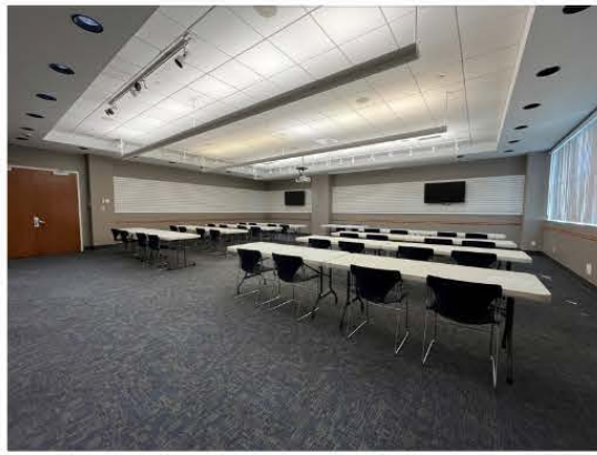
DeBakey Community Room (2nd Floor)