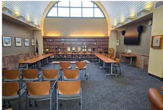
Thielen Community Room (2nd Floor)

Kitchen area available with coffee pots, refrigerator, ice maker, and microwave ( Kitchen shared with Thielen Room ). Equipment available upon request. Furniture can be moved, but must be returned to original setup when done.