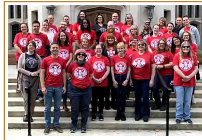
Bexley Public Library Staff