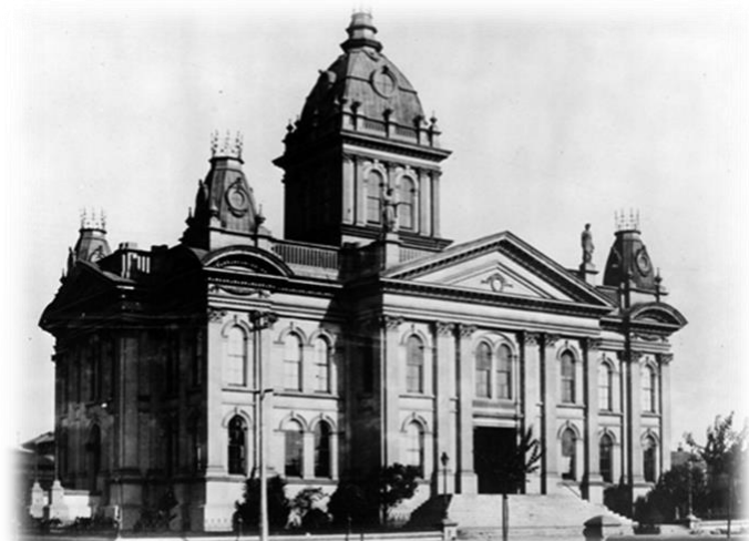
1875, Alameda County, California, Courthouse. Permission to use.